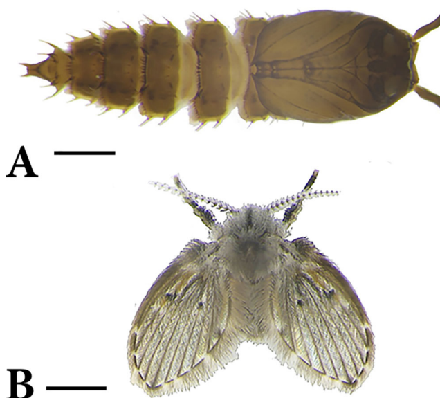
Fig. 2 Pupa and adult Clogmia albipunctata recovered from cesspool around the house of the patient. A. Dorsal view of Clogmia albipunctata pupa. B. Adult Clogmia albipunctata (Scale bar 1 mm / Pupa et adulte de Clogmia albipunctata retrouvés dans la fosse septique, près de la maison de la patiente. A. Vue dorsale de la pupa de Clogmia albipunctata . B. Clogmia albipunctata adulte (échelle 1 mm)

Several dipterans species have been implicated to cause urinary myiasis including Psychoda albipennis [11,17], Lucilia